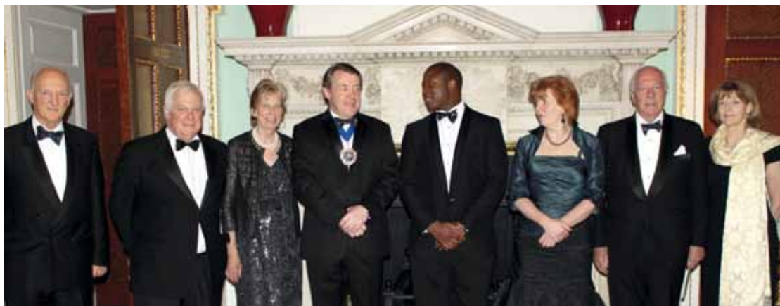
Making merry at the Mansion House

"It is hoped that once the premises reopen all our members will be able to enjoy to the full the new facilities - secure in the knowledge that plaster will not fall on their heads while they are dining."